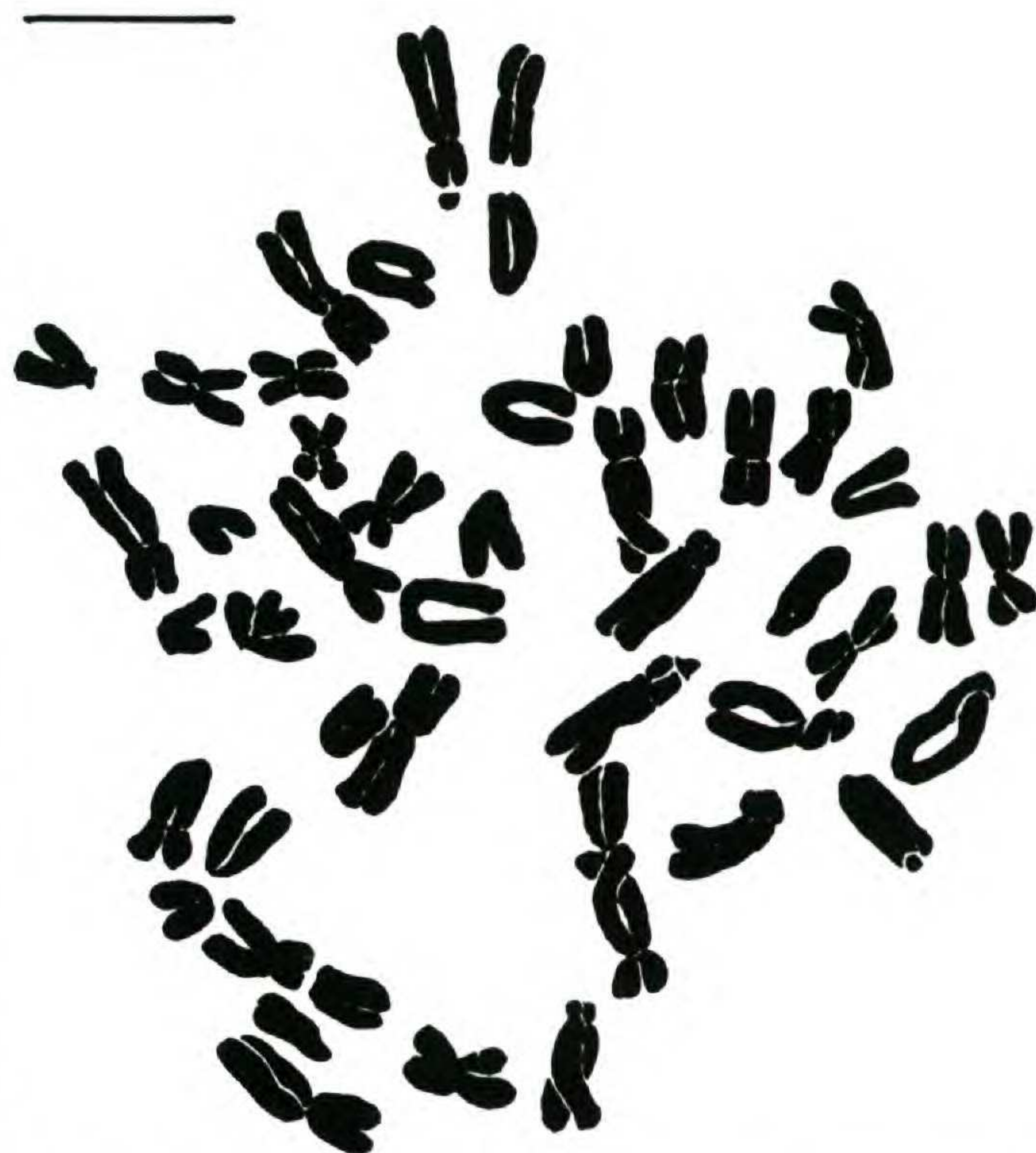
Figure 2. Chromosomes of Hymenocallis godfreyi at mitotic metaphase prepared by G. Lom. Smith from Godfrey 83697 . The scale equals 10 \mu m. (Ink preparation by M. Garland.)

Hymenocallis godfreyi , the St. Marks marsh spider-lily, is a rare endemic that grows in a seemingly fire-dependent habitat. It begins to bloom in early to mid March in areas of the marsh burned during the winter. Flowering continues into May.